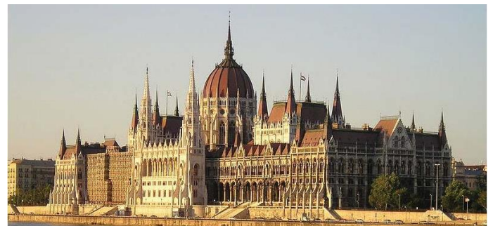
House of Parliament